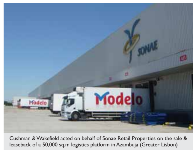
Cushman & Wakefield acted on behalf of Sonae Retail Properties on the sale & leaseback of a 50,000 sq.m logistics platform in Azambuja (Greater Lisbon)

Prime yields hardened marginally in 2010 but should remain stable this year, although secondary yields may soften further still. A few core German funds and opportunistic investors are